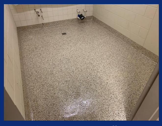
Epoxy Flooring in Area F Staff Restroom