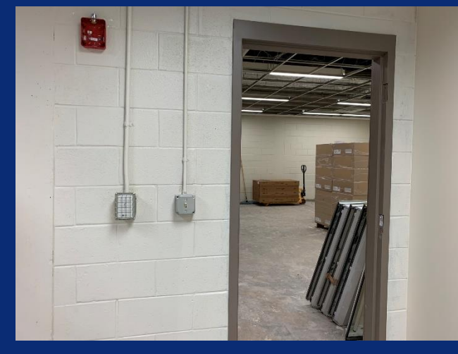
Wall Devices in Area K