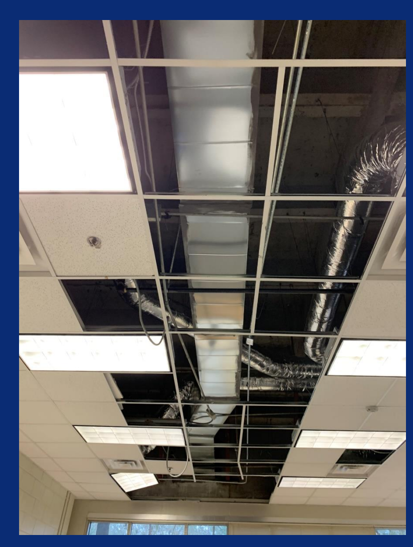
Exhaust Vent in Area G