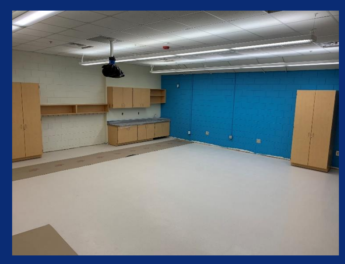
Final Paint in Main Level Classrooms