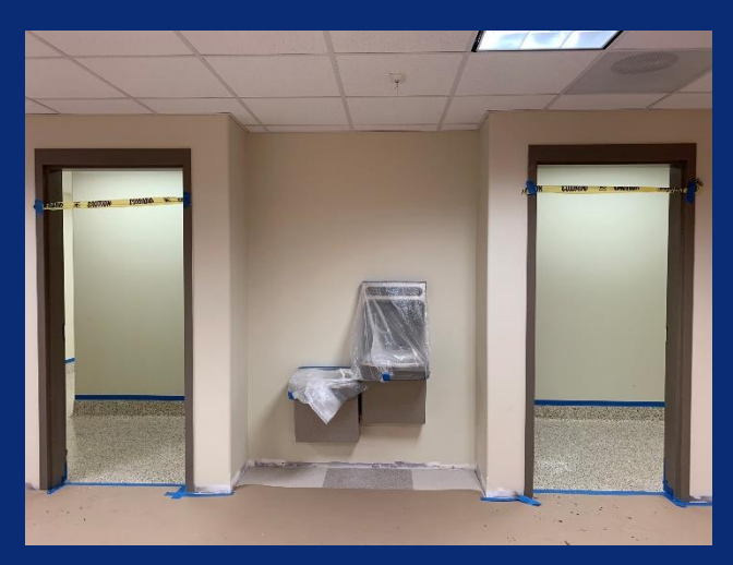
Drinking Fountain in Area F