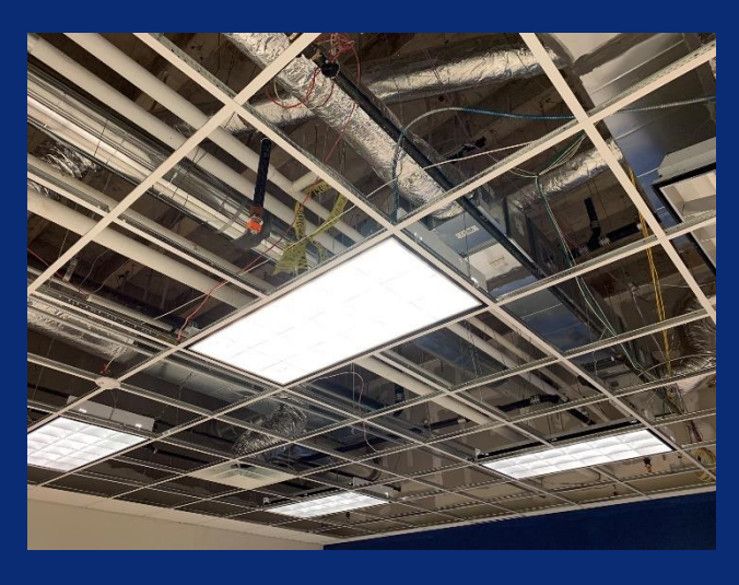
Overhead in Area K Classroom